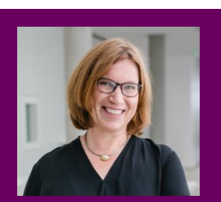
Helmholtz Zentrum München

Core facility coordination team Email: <u>corefacilitykoord@helmholtz-munich.de</u>