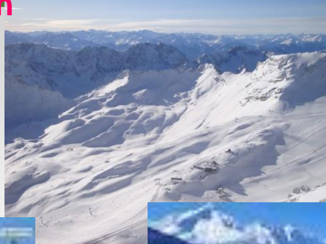
Garmisch and Zugspitze Peak